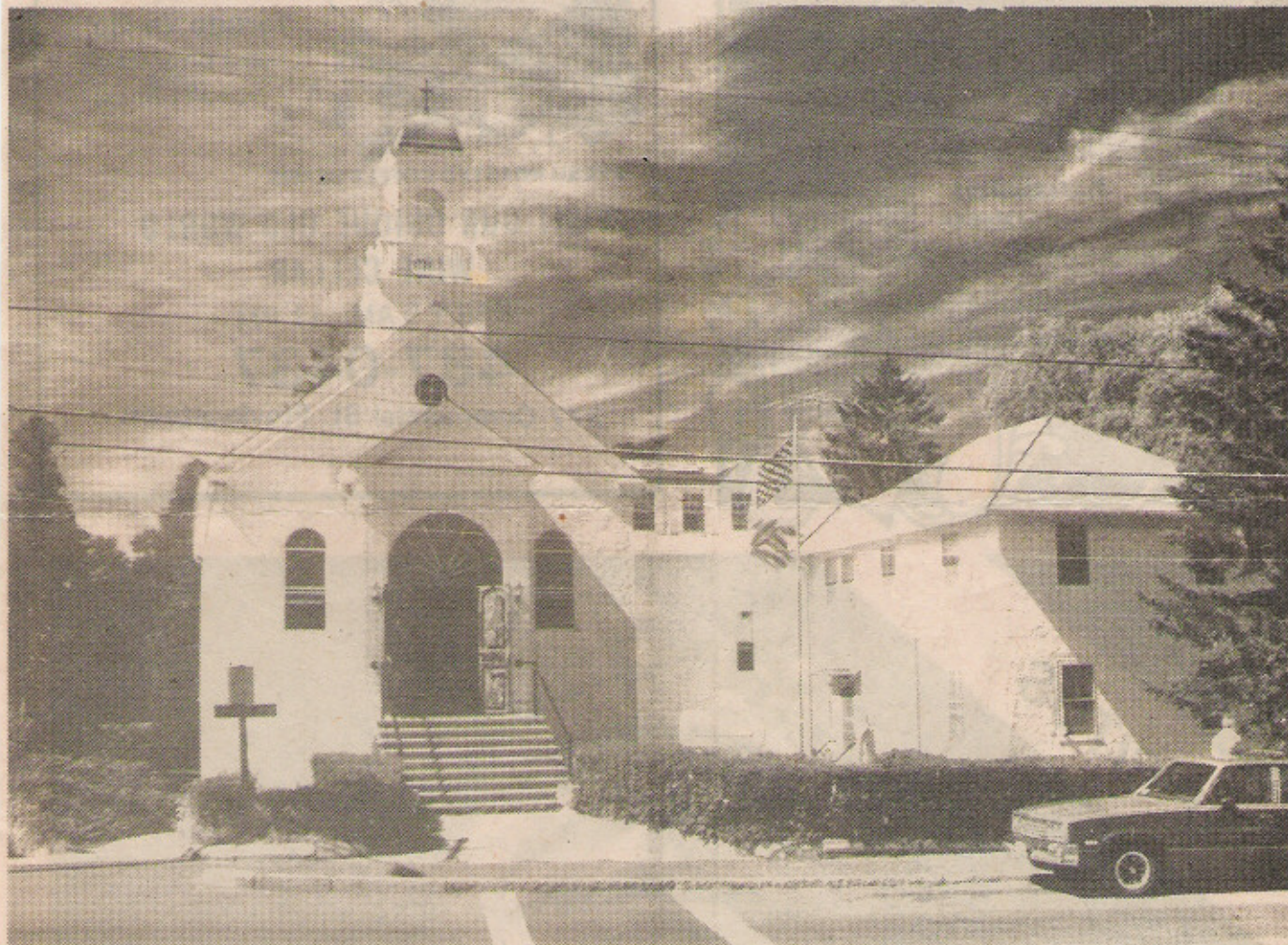
today's church with hand-carved doors